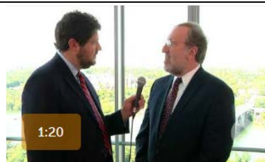
"Common Ownership" and its Possible Consequences