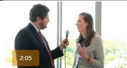
Should Investors Be Worried About ETF Liquidity Risk?