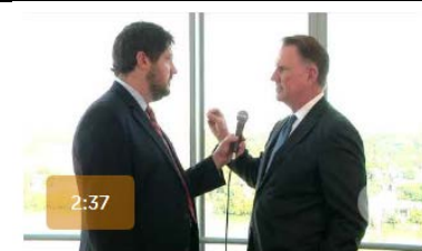
How Active Managers Can Successfully Navigate Industry