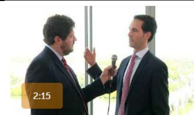
The Role of Fixed Income ETFs in Institutional Portfolios